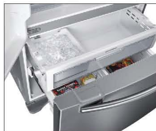
Conveniently located in the freezer, Samsung's ice maker provides filtered ice cubes.