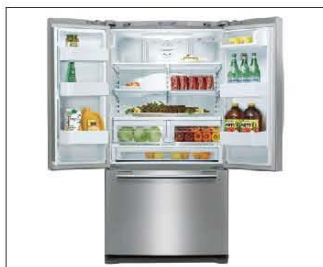
French Door design provides easy access to fresh food and flexible storage options.

036725569676 036725569645 036725569652 036725569669