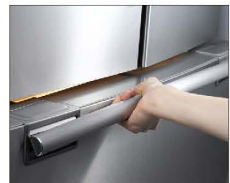
EZ-Open Handle ™ lifts the handle to open the freezer with no force needed.

Actual color may vary. Design, specifications, and color availability are subject to change without notice. Non-metric weights and measurements are approximate.