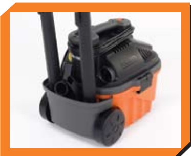
Built-In Caddy for Accessory Storage