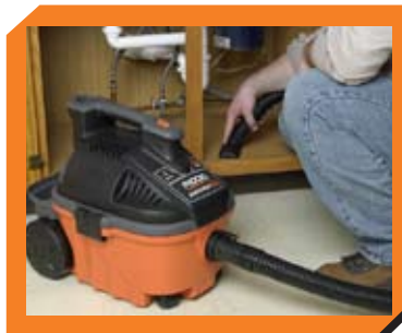
Wet Pick-up - Workshop, Sinks, etc.