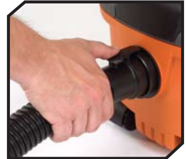
Tug-A-Long® Locking Hose