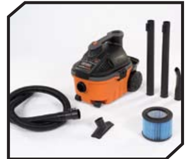
Vac with Accessories & Filter