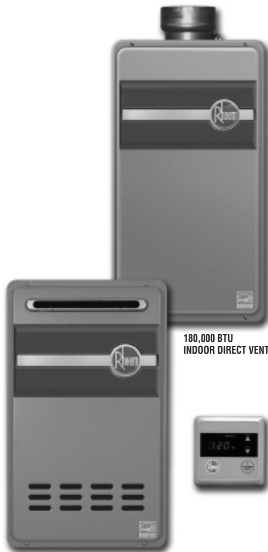
180,000 BTU INDOOR DIRECT VENT

See Commercial Warranty Brochure for details.