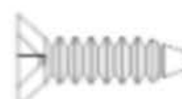
#8 x 5/8" Flat-head Phillips screw x 8