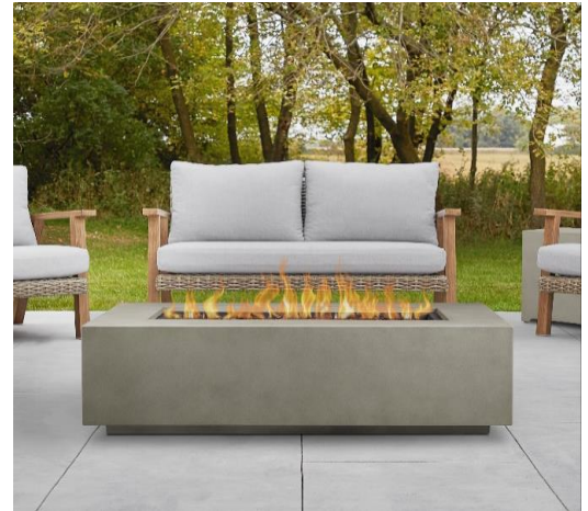
Available in Mist Gray (C9813LP-MGRY)