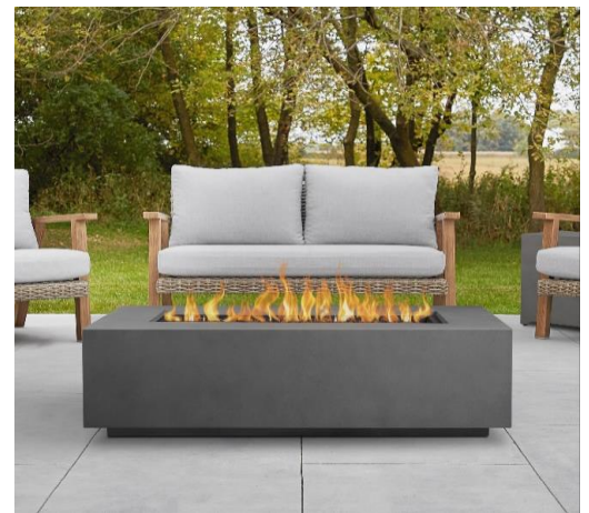
Available in Weathered Slate (C9813LP-WSLT)