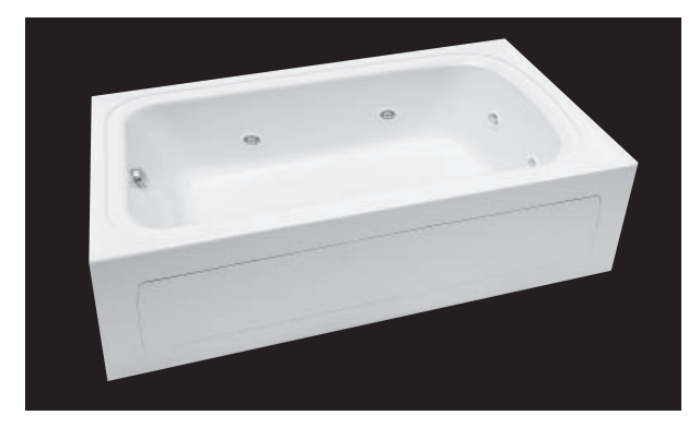
With Integral Skirt