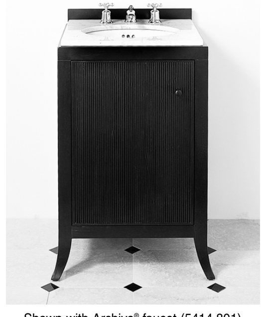
Shown with Archive® faucet (5414.801)