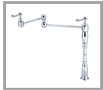
#2AM700 SHOWN * ADA