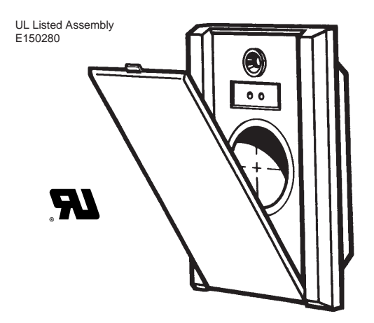
Save These Instructions

For use with NuTone CH610, CH615 or CH620 Central Cleaning System Hoses.