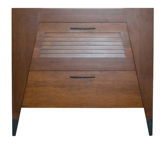
VNS362- Woven Strand Bamboo