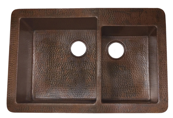
CPS275- Antique CPS575- Brushed Nickel