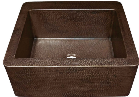
CPS270- Antique CPS570- Brushed Nickel