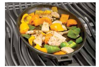
Professional Cast Iron Skillet 56003

Visit napoleongrills.com to see Napoleon's complete line of grilling accessories.