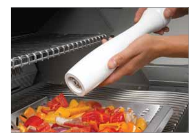
Salt Grinder 70005