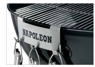
Charcoal Kettle Tool Hanger