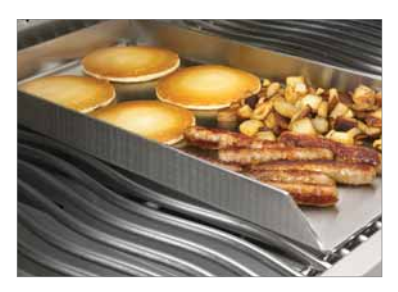
Stainless Steel Griddles