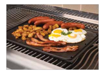
Cast Iron Griddles