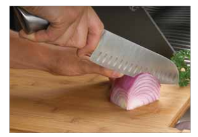
Chef's Knife 55207