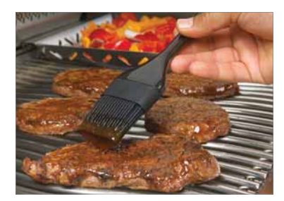
Silicone Basting Brush - 14" 70018