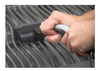
Stainless Steel Grill Brush 62035