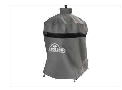
Kettle Leg Grill Cover 63910