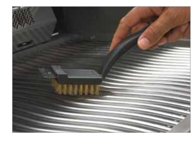
Grill Brush with Scraper - 10" 62010