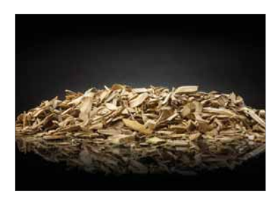
Wood Chips Mesquite, Maple, Hickory, Cherry, Apple

Place wet wood chips into the smoker tube and place over the left burner, then turn the burner on. Place your meat over the right burner, but do not turn on that burner. You are using the indirect cooking method. Smoke the meat for several hours under a closed lid. To achieve maximum flavour, fresh wood chips may be added several times during the cooking process.