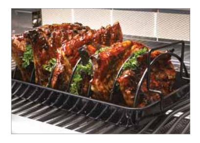
3 in 1 Non-Stick Rib/Roast Rack 56011