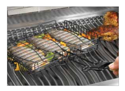
Multi-Grill Basket 57010