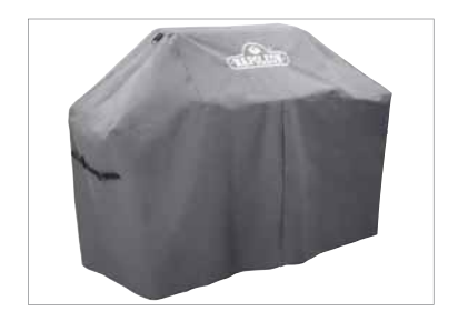
605 Series Heavy Duty Grill Cover