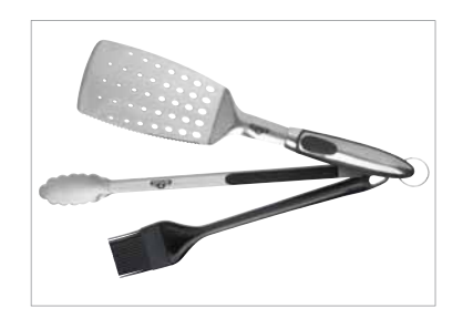
Three Piece Toolset 70019