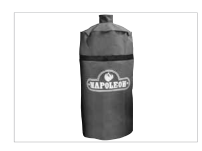
AS300K Apollo<sup>®</sup> Grill Cover 63900