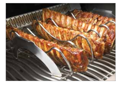
Stainless Steel Rib & Roast Rack