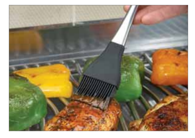
Stainless Steel Silicone Brush 55005