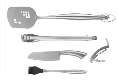
Professional Five Piece Toolset 70011