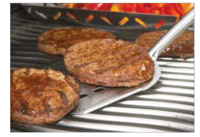
Professional Spatula 70010