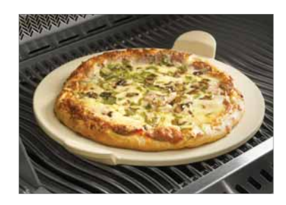
Pizza Set with Stone & Wheel