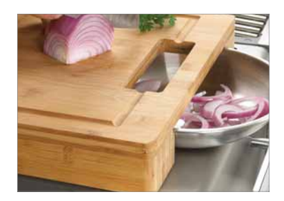
Professional Cutting Board Set 70012