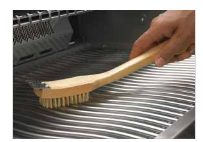
Brass Grill Brush - 18"