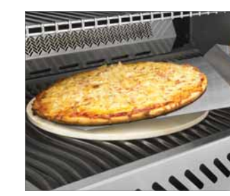
Pizza Spatula 70003