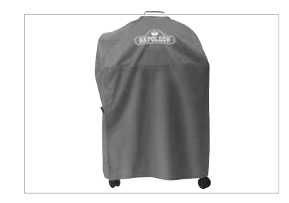
Kettle Cart Cover