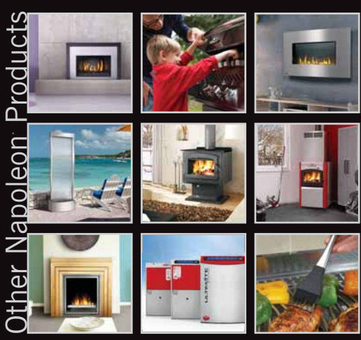
Fireplace Inserts • Charcoal Grills • Gas Fireplaces • Waterfalls • Wood Stoves Hybrid Furnaces • Electric Fireplaces • HVAC Equipment • BBQ Accessories