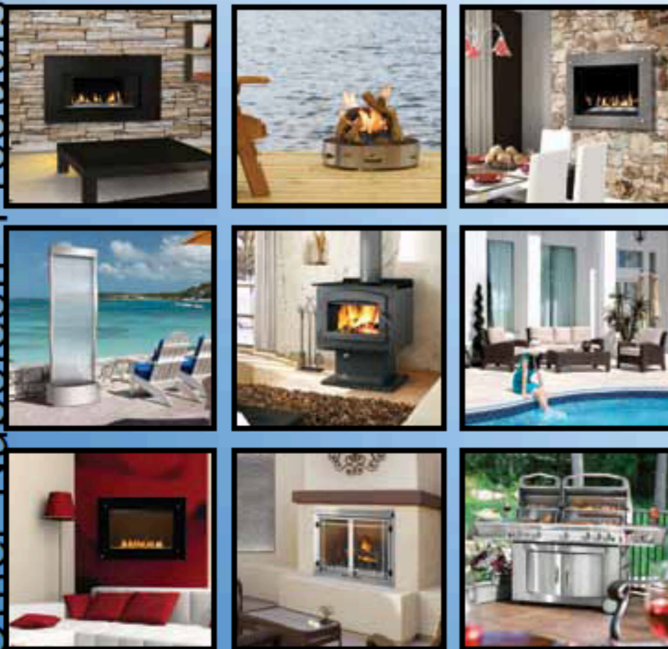
Fireplace Inserts • Patioflames • Gas Fireplaces • Waterfalls • Wood Stoves Casual Furniture • Electric Fireplaces • Outdoor Fireplaces • Gourmet Gas Grills