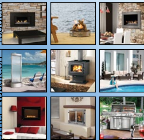
Fireplace Inserts • Patioflame • Gas Fireplaces • Waterfalls • Wood Stoves Casual Furniture • Electric Fireplaces • Outdoor Fireplaces • Gourmet Gas Grills