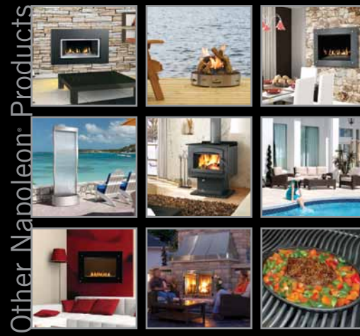
Fireplace Inserts • Patioflame* • Gas Fireplaces • Waterfalls • Wood Stoves Casual Furniture • Electric Fireplaces • Outdoor Fireplaces • BBQ Accessories