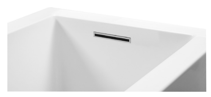
Must be specified when the tub is ordered. Available for select Designer Collection tubs only.

Sleek low profile overflow is factory installed \, \cdot \, Overflow measures 4.5" x 1" Provides a deeper soak \, \cdot \, Not available for commercial applications