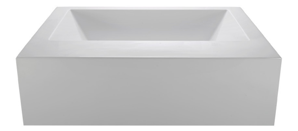
Available as a freestanding model or finished on 1, 2 or 3 sides for various installation applications.