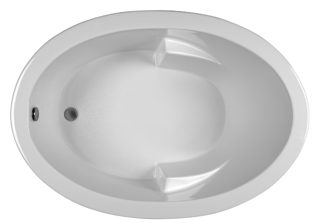
Features integral armrests. Shown with optional textured bottom.