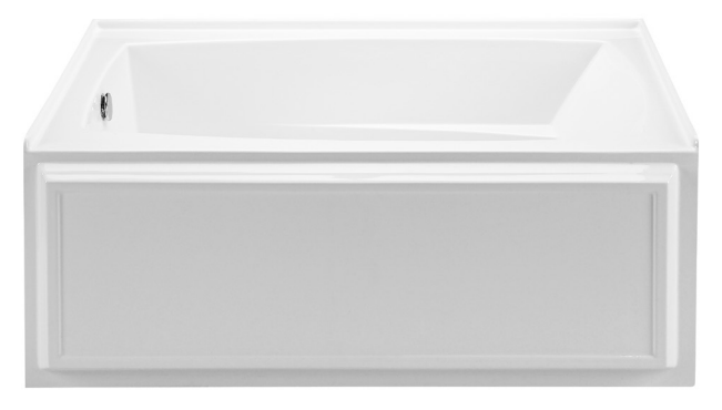
Wyndham 5 features integral skirting, tile flange and armrests.