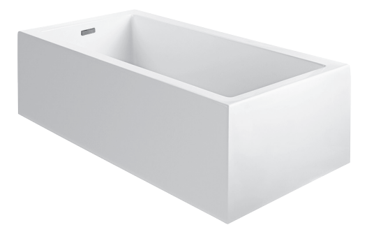
Available as a freestanding model or finished on 1, 2 or 3 sides for various installation applications.