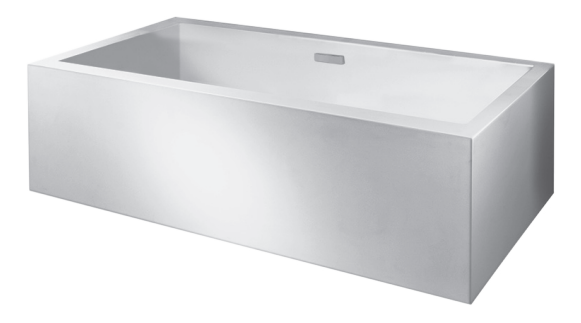
Available as a freestanding model or finished on 1, 2 or 3 sides for various installation applications.