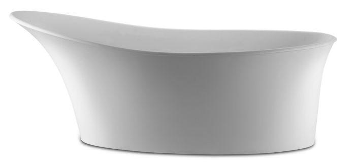
Features an integrated overflow.

NOTE: Filling this tub to the maximum may require an above average size or dedicated water heater.