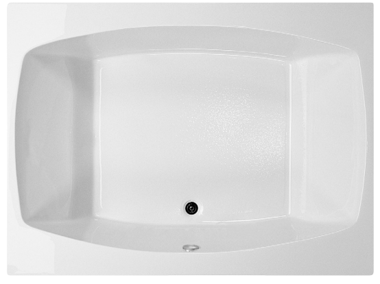
Features a textured bottom