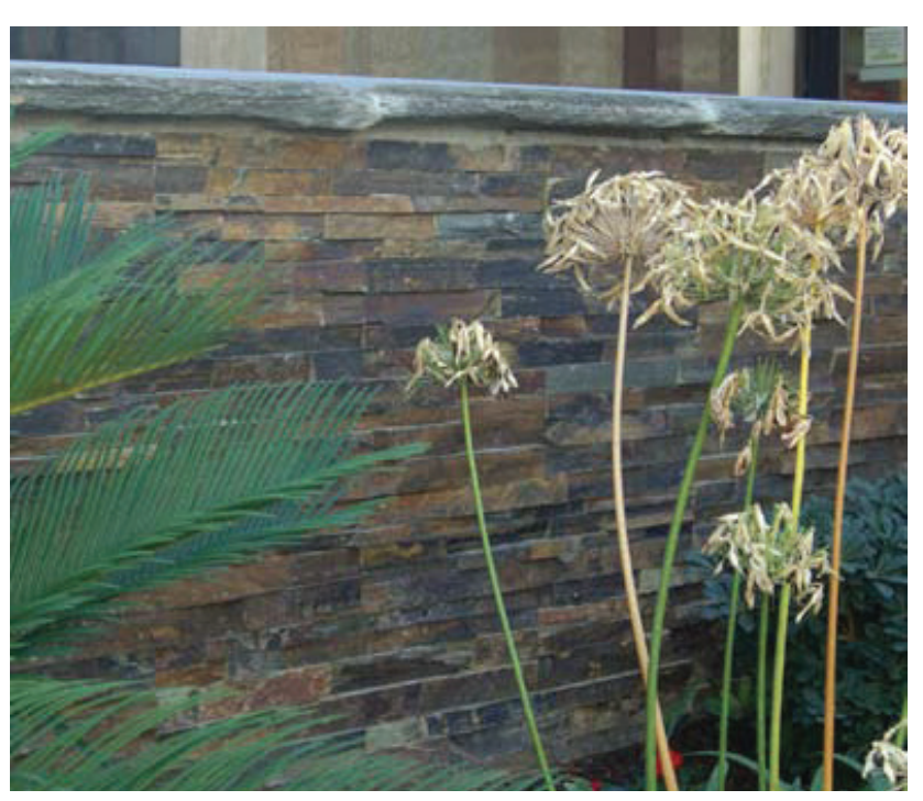
California Gold Ledger Panel