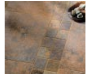
Red Canyon, 13" x 13" with coordinating Multi Blend Decorative Mosaic (cut into Mosaic Border).