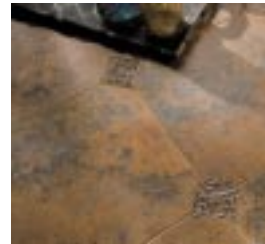
Red Canyon, 13" x 13" with coordinating Vintage Bronze English Ivy Decorative Corner/Insert.