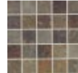
5450 2 1/2" x 2 1/2" (12 3/4" x 12 3/4" nominal) Multi Blend Decorative Mosaic (cut into Mosaic Border)