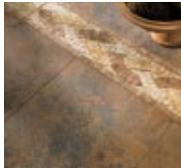
Red Canyon, 13" x 13" with coordinating Sand/Walnut/Gold/Red Basketweave Decorative Border.

Decorative Tile Options featured in the photography below are examples of how different products can work together. (See Artistic Collection for Coordinating Tile Options for other colors.)