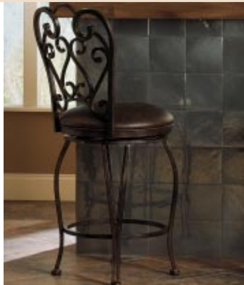
Red Canyon, 20" x 20" with coordinating Decorative Tile Options pictured in the room scene (front).