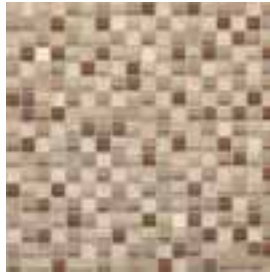
5/8 x 5/8 Mosaic Caramel Splash Blend