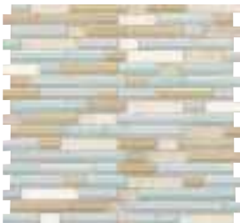
5/8 x Random Mosaic Blue Ice Blend