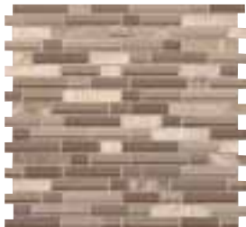
5/8 x Random Mosaic Pecan Taupe Blend