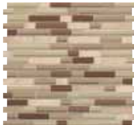
5/8 x Random Mosaic Caramel Splash Blend