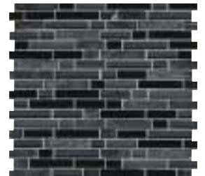
5/8 x Random Mosaic Black Cloud Blend