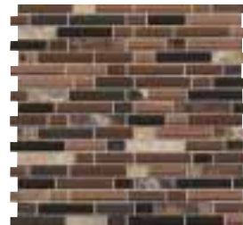
5/8 x Random Mosaic Brown Toffee Blend