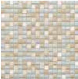
5/8 x 5/8 Mosaic Blue Ice Blend