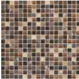
5/8 x 5/8 Mosaic Brown Toffee Blend