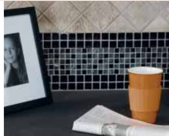
Black Cloud Blend, 5/8 x 5/8 mosaic shown with Midnight Black, 1 x 1 mosaic and Nile Gray, 3 x 3 mosaic. Diamond pattern shown.