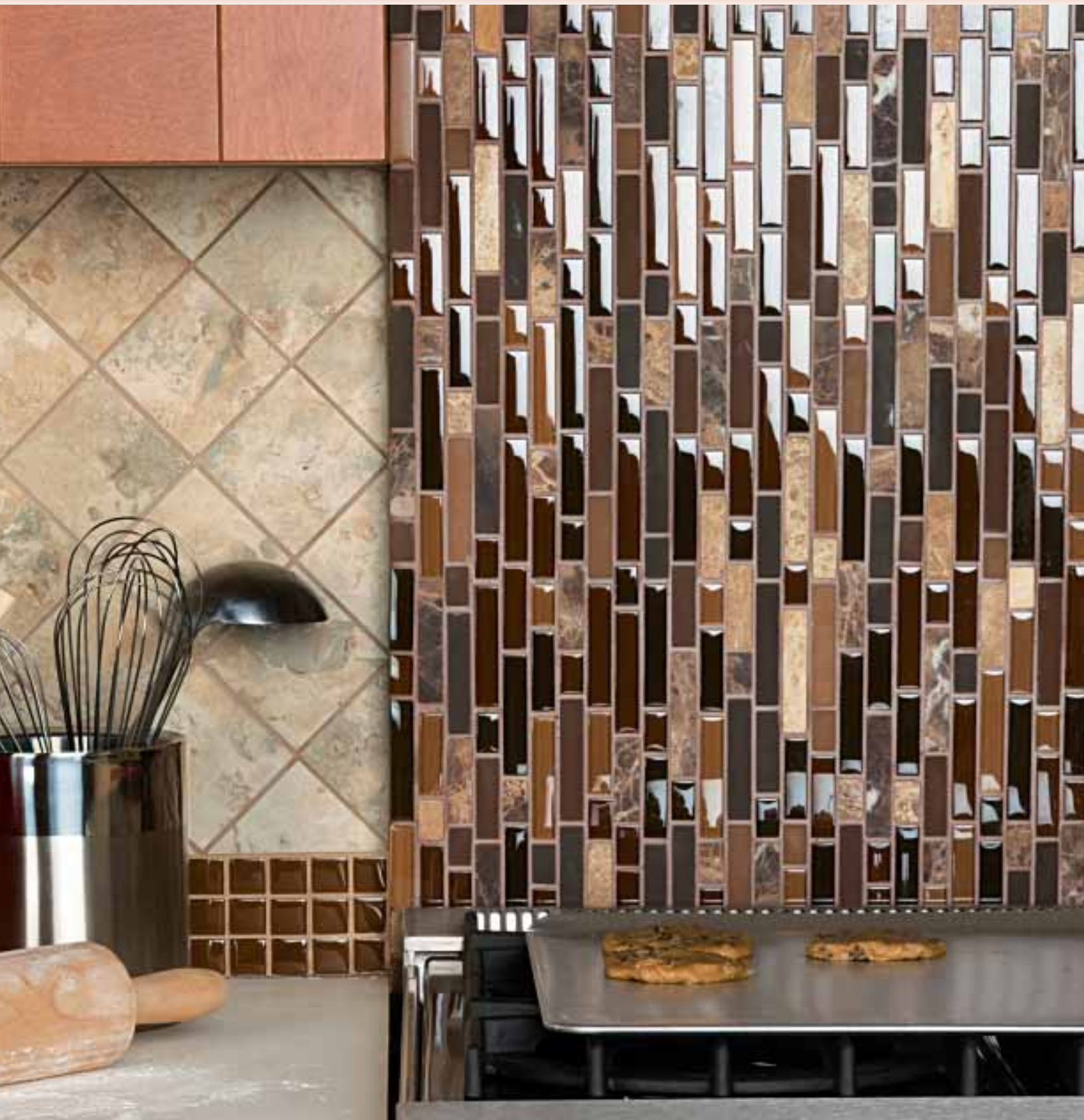
Almond Spice, 3 x 3 mosaic. Diamond pattern shown. Brown Toffee Blend, 5/8 x Random with coordinating Caramel Sundae, 1 x 1 mosaic on backsplash.