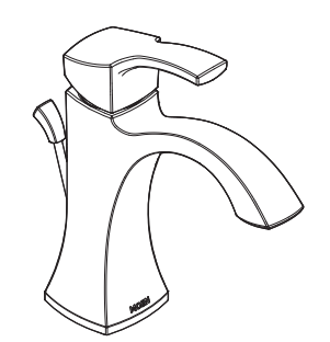
VOSS™ Single-Handle Lavatory Faucet