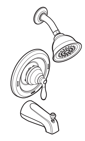
CALDWELL™ Single-Handle Tub/Shower Eco-Performance