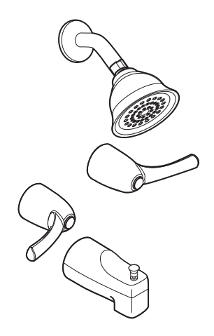
MOEN° Two-Handle Tub/Shower Valve Eco-Performance