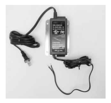
Multi-Unit Power AC Adapter & 24" Wire Lead Model: 104408 (adapter)

Warranted for 1 year against material or manufacturing defects