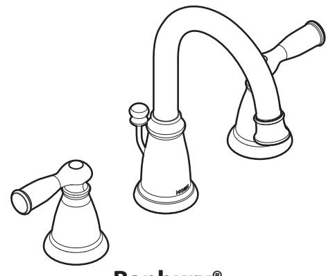
Banbury® Two-Handle Widespread Lavatory Faucet