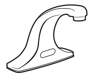
M•Power™ Deck-Mount (4" Center), Non-Mixing, Battery Powered Electronic Faucet

• Warranted for 5 years against material or manufacturer defects