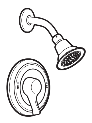
Single-Handle Pressure Balancing Shower Valve with HAF