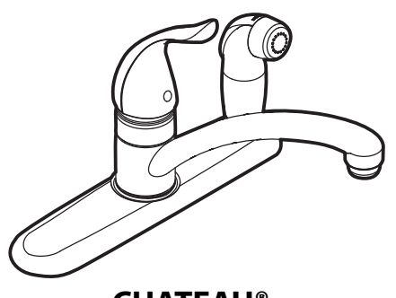
CHATEAU® Single-Handle Kitchen Faucet w/Protégé Side Spray in Deck Plate