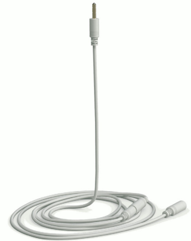
Flo by Moen™ Smart Water Detector 6' Leak Sensing Cable