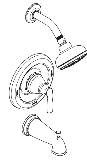
Hilliard™ Single-Handle Tub/Shower Valve

Visit www.moen.com/support for complete details and limitations