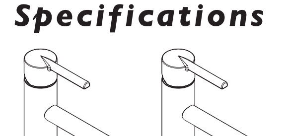
Arlys™ Single-Handle Lavatory Faucet

• 5 year limited warranty when used in a commercial installation Visit www.moen.com/support for complete details and limitations