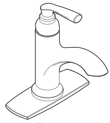
Hilliard™ Single-Handle Lavatory Faucet