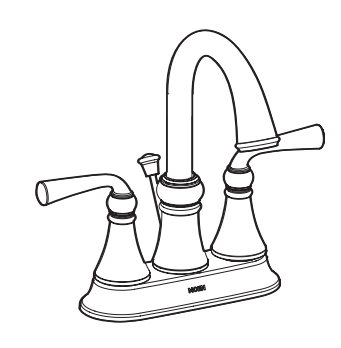
Wetherly™ Two-Handle Lavatory Faucet

• *Service kits available for thicker or thinner deck applications (See Parts view)