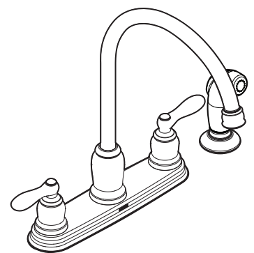
Banbury® Two Handle Lever Kitchen Faucet with Protégé® Side Spray