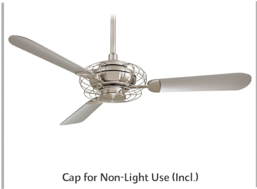
Cap for Non-Light Use (Incl.)