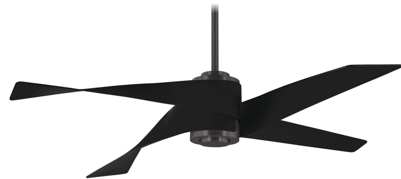
Cap for Non-Light Use (Incl.)