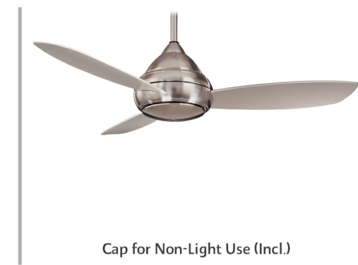
Cap for Non-Light Use (Incl.)