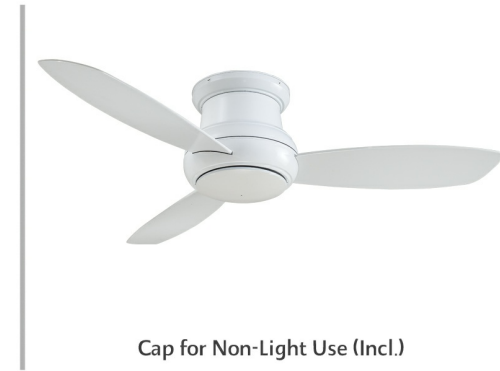
Cap for Non-Light Use (Incl.)