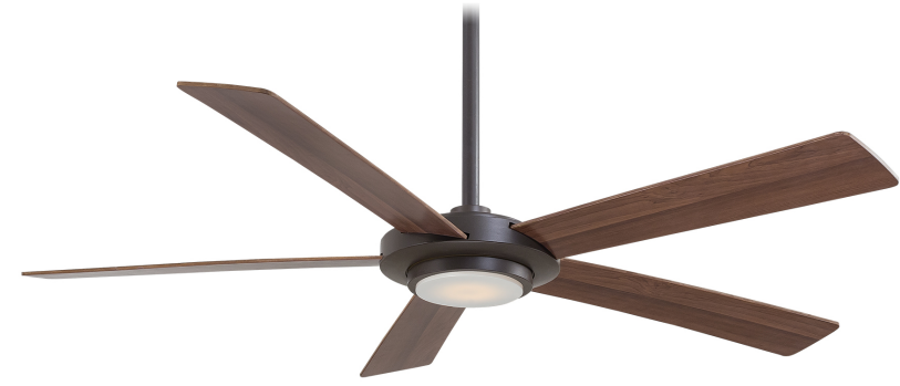
Shown with Reversible Dark Walnut Blades