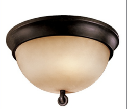
Decorative Element Removable