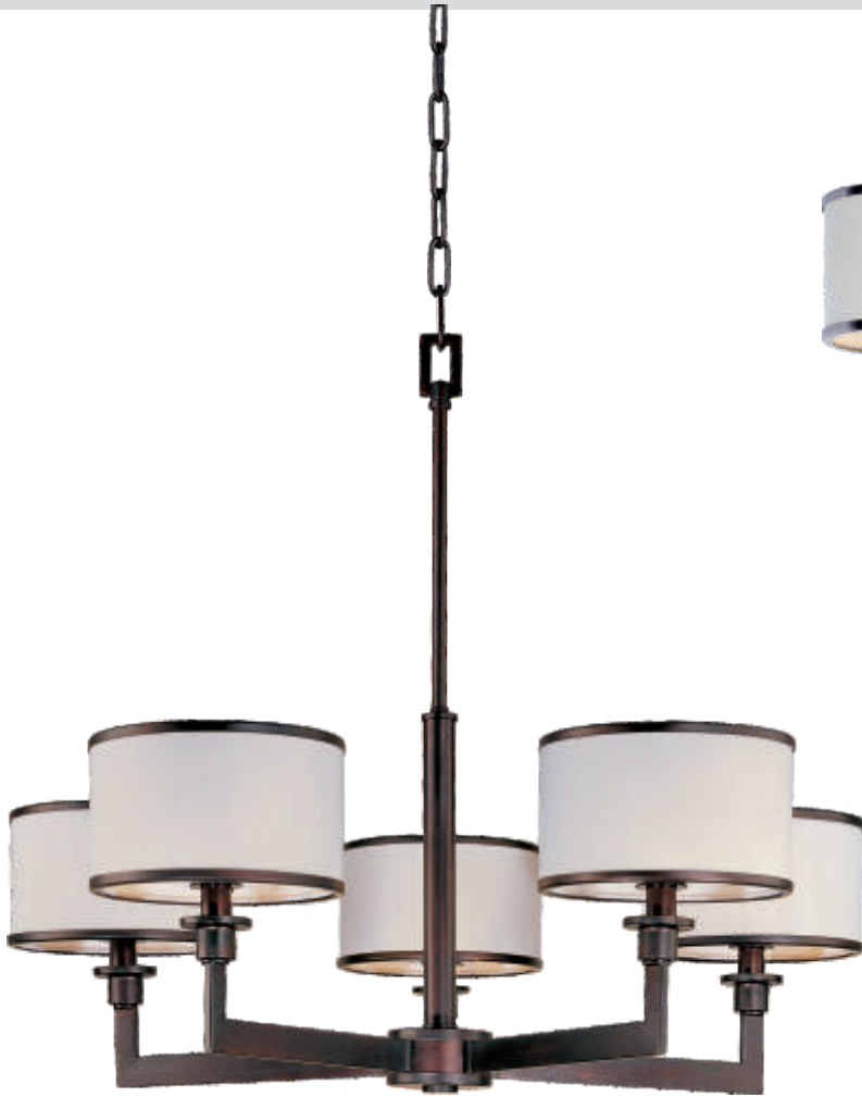
12055 WTOI, WTSN Chandelier B