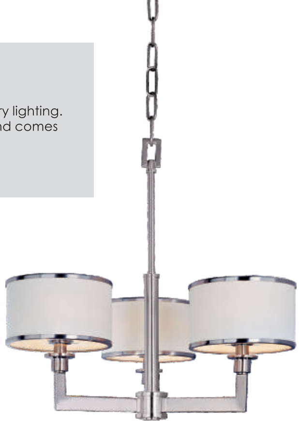
12054 WTOI, WTSN Chandelier A

The Nexus collection is the true standard for contemporary lighting. The flat rectangular tube arm forms to a perfect angle and comes finished in choice of Satin Nickel or Oil Rubbed bronze. The White fabric drum shade is trimmed with metal rings in matching finish for a clean, tailored look.