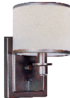
12059 WTOI, WTSN Wall Sconce C