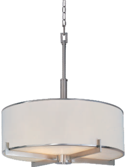
12053 WTOI, WTSN Pendant E