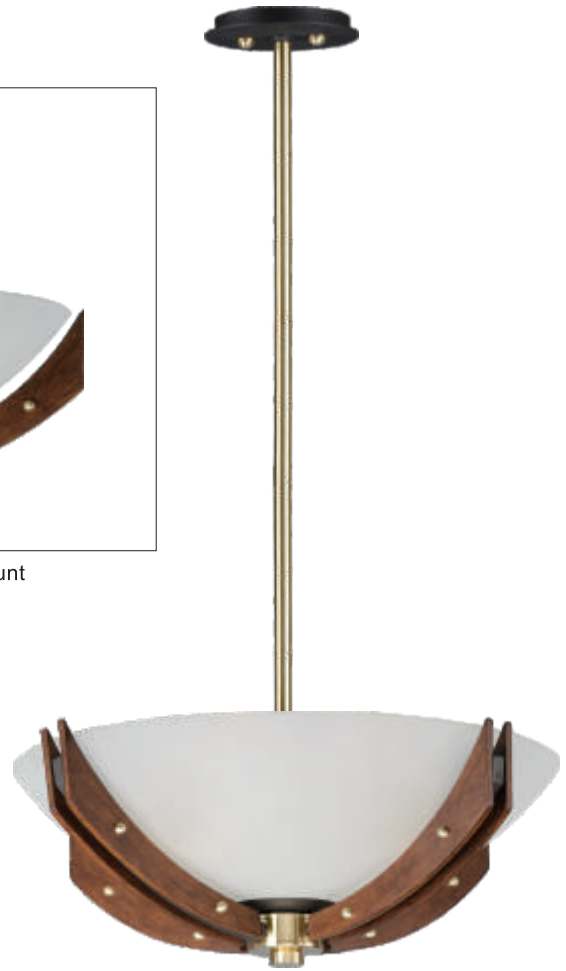
39511 CLBKWE, CLBZAP Pendant/Semi-Flush Mount

• Pendant convertible to Semi-Flush Mount