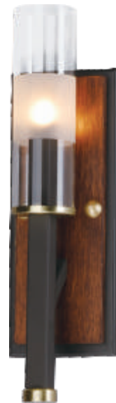
39519 CLBKWE, CLBZAP Wall Sconce