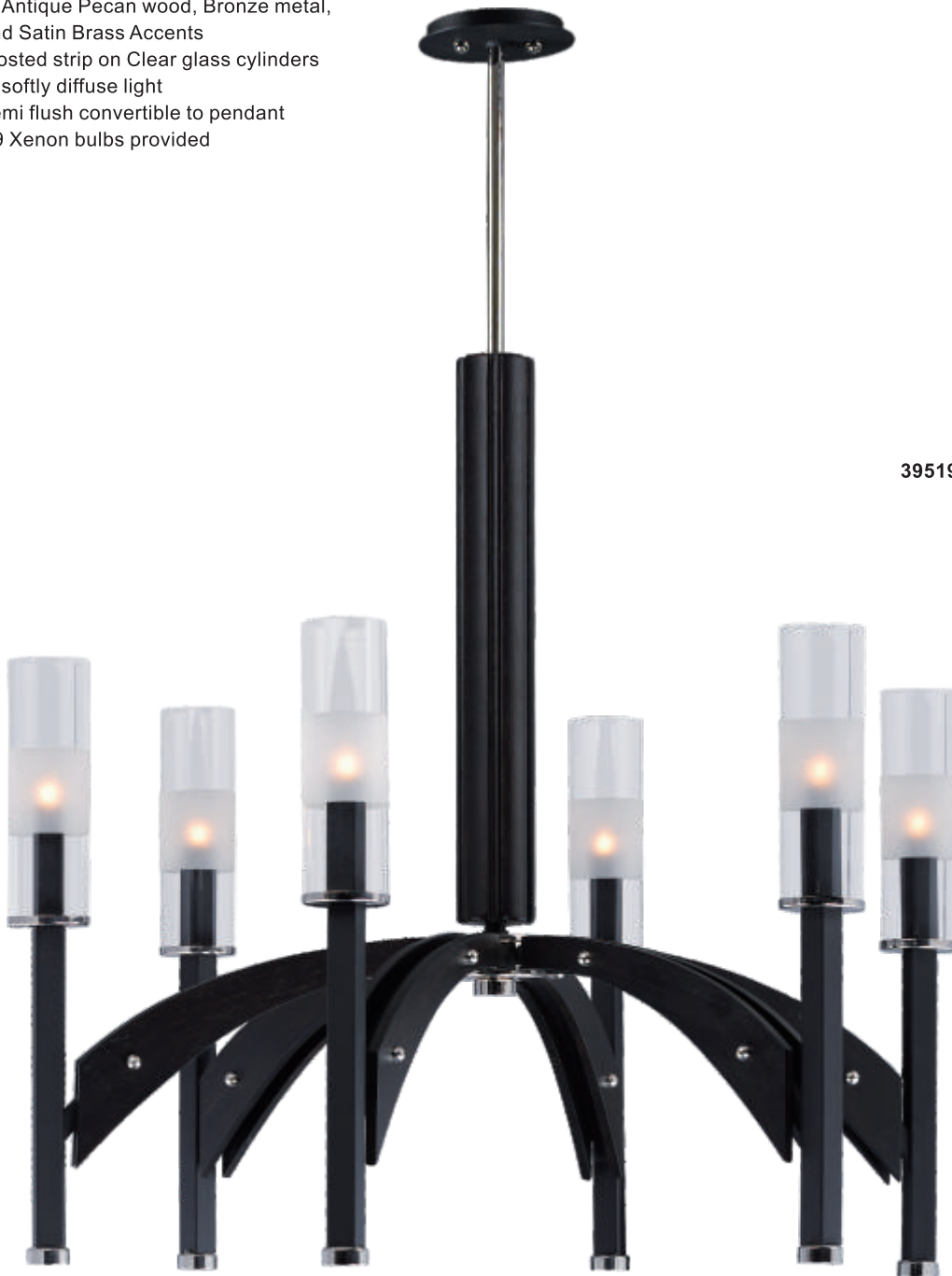
39516 CLBKWE, CLBZAP Chandelier