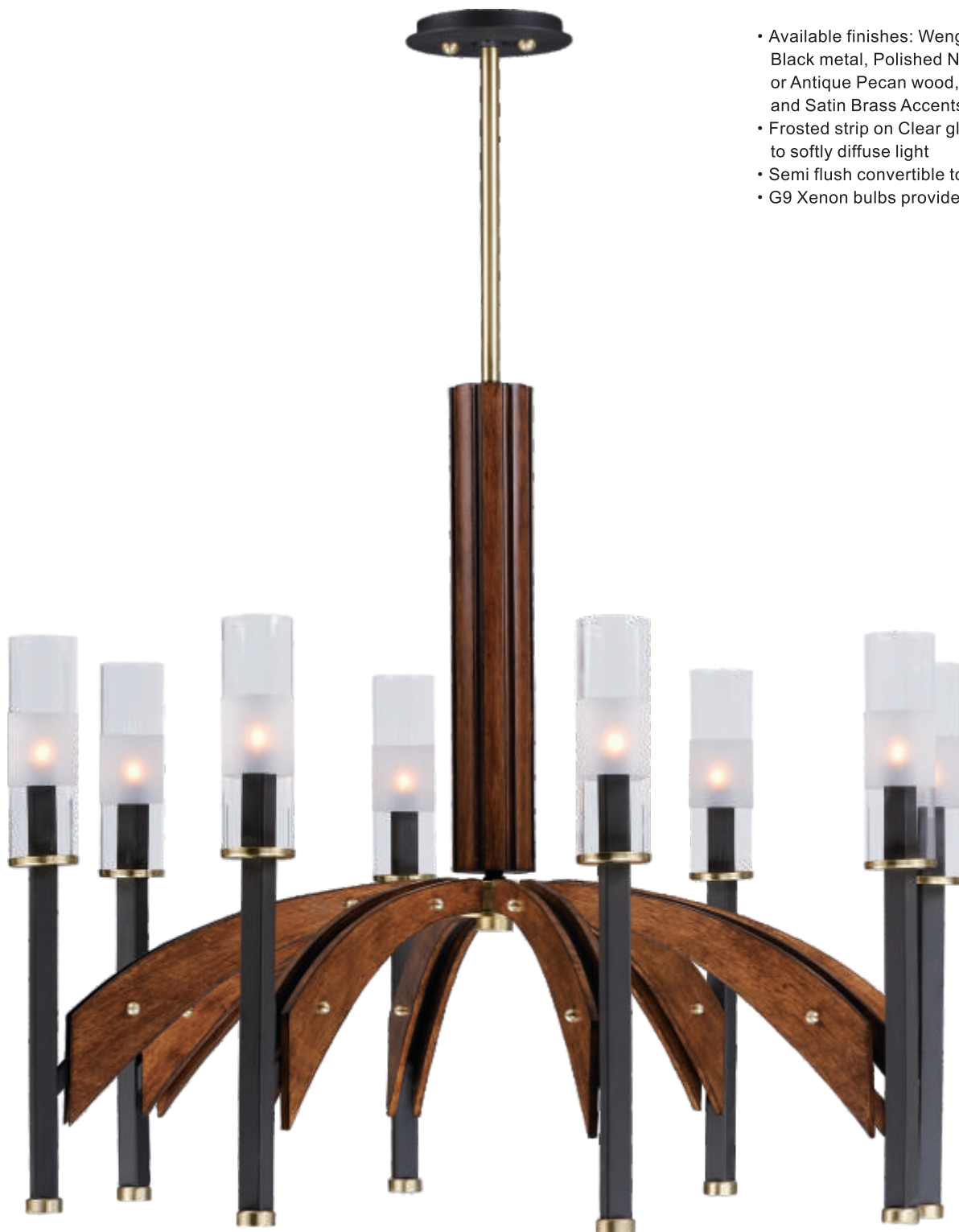
39518 CLBKWE, CLBZAP Chandelier