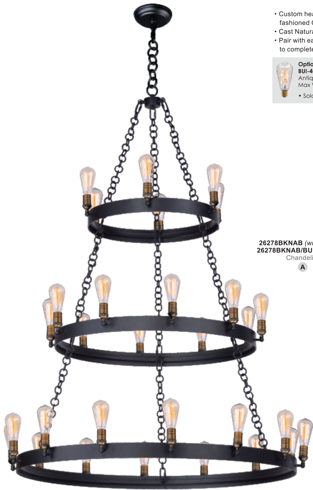
26278BKNAB (without Bulb) 26278BKNAB/BUI (with Bulb) Chandelier