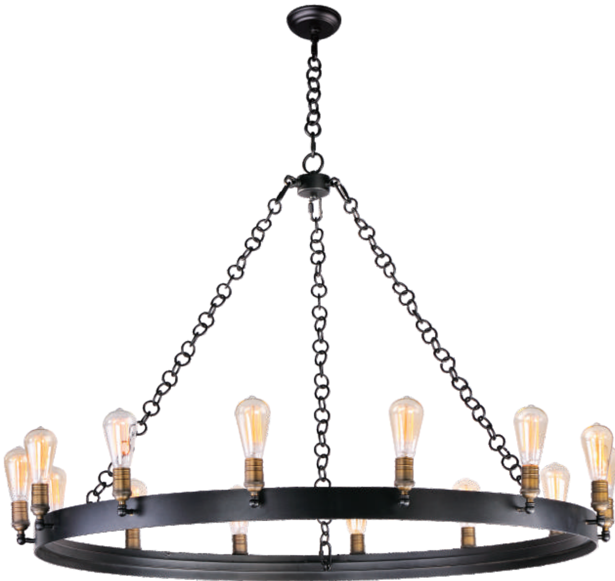
26276BKNAB (without Bulb) 26276BKNAB/BUI (with Bulb) Chandelier