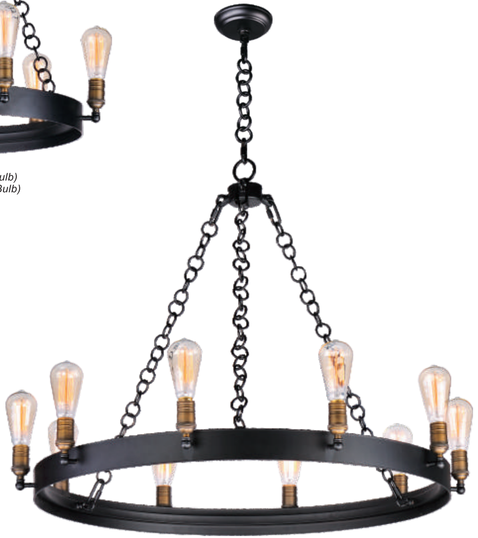
26275BKNAB (without Bulb) 26275BKNAB/BUI (with Bulb) Chandelier