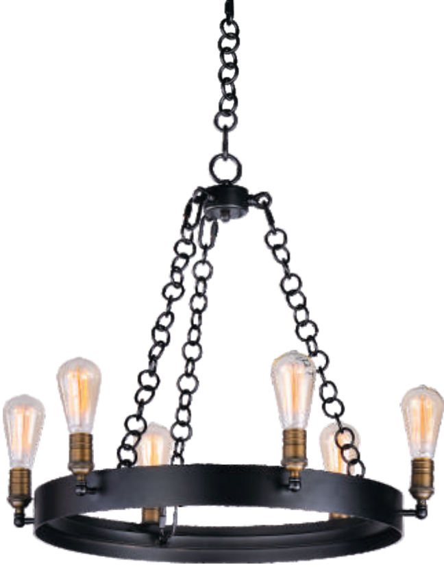
26273BKNAB (without Bulb) 26273BKNAB/BUI (with Bulb) Chandelier

Optional Vintage Bulb BUI-40W-ST58-E26-CL-120V Antique Light Bulb Max Wattage: 40 • Sold Separately